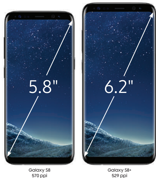
Galaxy S8 570 ppi

Infinity Screen: Work bigger, work better on a screen without limits. With the world's first infinity display that wraps from edge to edge, you can see more, show more and do more in a way that not only helps you look professional, but keeps you looking forward. You can use multiple windows to edit documents and text with a full-size keyboard, and send files all at the same time, on one large, stunning display.