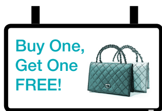
48" Digital Indoor Signage Display