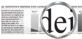
De-ICE (Integrated Cavity Effect)