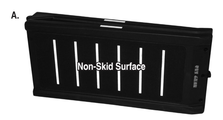
Step 1. Unfold ramp and place on firm surface with non-skid surface facing up (Figure A).