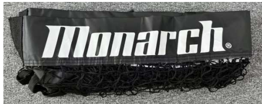
Pickleball Net x1