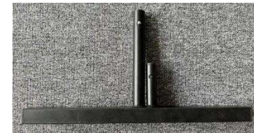
Center Base x1