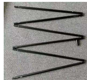
Center Poles x1