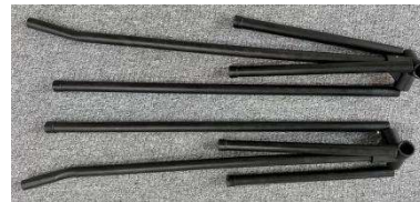
Side Support Poles x1