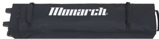
Deluxe Carry Bag x1