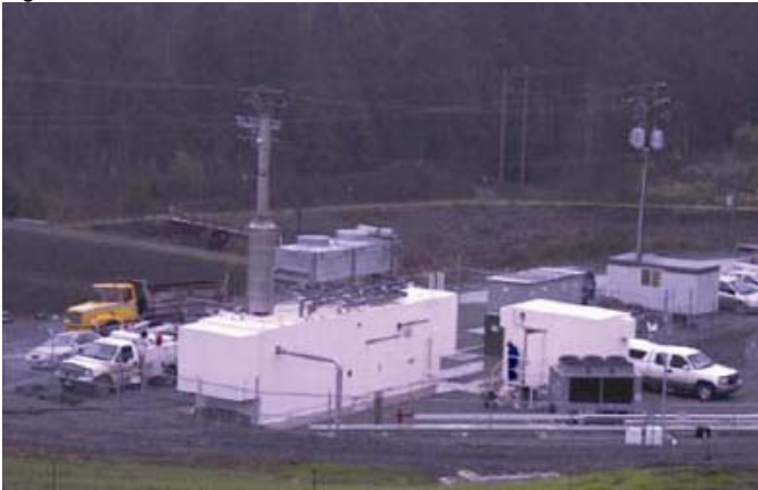
Figure 6: Harland Landfill, Victoria, BC, Canada

The landfill receives municipal solid waste from a population of roughly 400,000. Until the power generating system went online, the landfill gas had been flared. Independent power producer Maxim Power Corporation of Calgary, Alberta, installed the land-fill-gas-to-energy system (see Fig. 6). The electric energy output (continuous duty at 1.6 MW) is being sold to BC Hydro for that company's Green Power program.