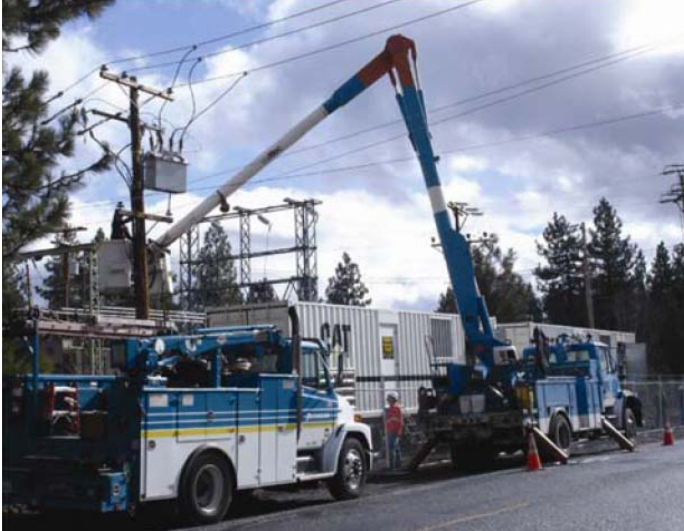
Figure 1: Cat XQ2000 Power Modules in Chester

Chester's lights remained on and the aging poles were replaced. PG&E avoided the combination of lost power sales during any outage, and the added expense and safety concerns of having to work crews around the clock for 72 hours to replace all the poles.