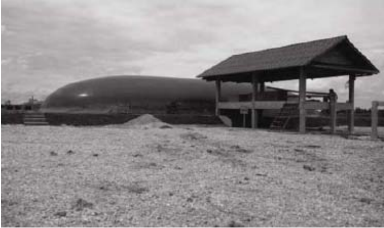
Figure 8: Buffer Tank and Digestion Process in Thailand