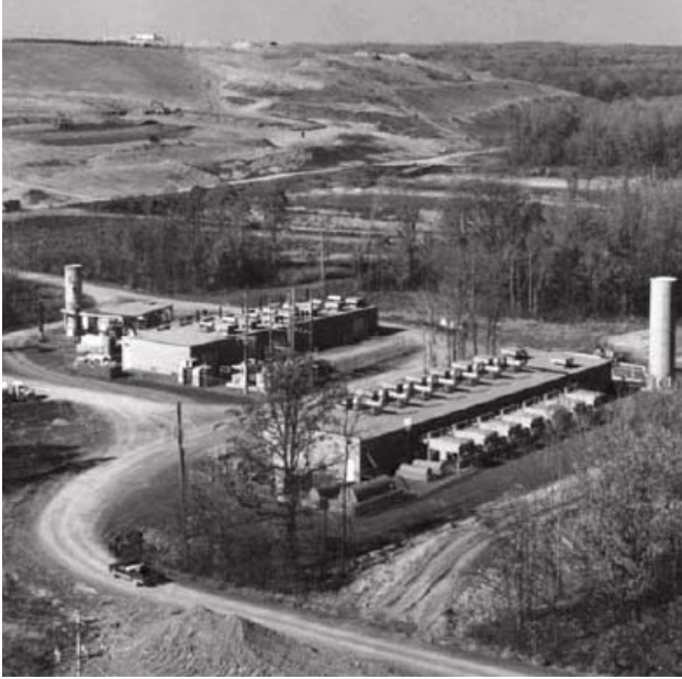
Figure 5: Seneca Meadows Landfill, Seneca Falls, NY

This energy system, owned by Innovative Energy Systems of Oakfield, NY, began operation in 1996 and has been expanded three times to its current 11.2 MW capacity. The system (see Fig. 5) uses fourteen Cat G3516 generator sets that have been modified for landfill use. Overall energy plant NOx emissions are compliant with local air-quality standards.