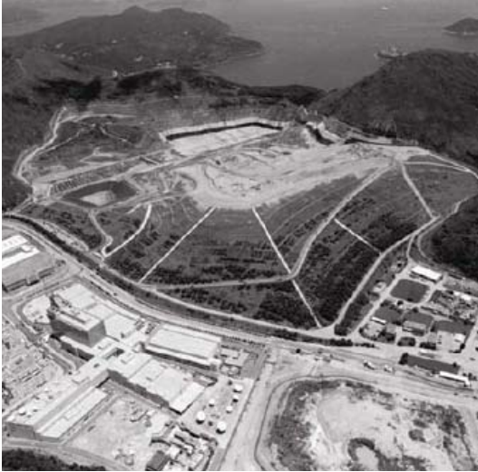
Figure 7: South East New Territories Landfill, Hong Kong

This site operated by Green Valley Landfill Ltd., installed two Cat G3516 landfill generator sets in 1997. Each unit is rated at 970 kW, providing 1.9 MW of continuous power for the landfill infrastructure and an on-site wastewater treatment plant (see Fig. 7). The units operate in parallel with the local utility, exporting excess power to the grid. The generator sets have oversized radiators to compensate for tropical heat and humidity.