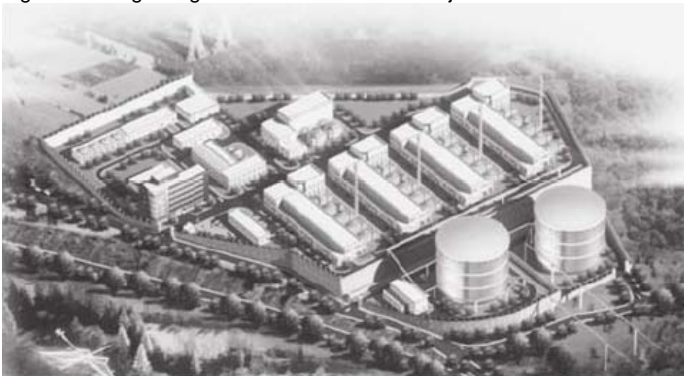
Figure 10: Jingcheng CMM 120 MW Power Project

When fully commissioned, the sixty generator sets will produce over 108 MW of electric power. Additionally, the exhaust will be recovered and used to drive steam turbines to produce an additional 12 MW of electric power. The eventual production target is a combined 120 MW with jacket water heat recovery for hot water production. This project is the largest of its kind in the world.