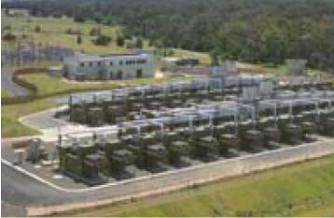
Figure 9: Appin and Tower Coal Seam Energy Project

The Appin and Tower project (see Fig. 9) is one of the largest coal seam gas energy systems in the world and one of the world's largest engine-generator installations of any kind. The Appin and Tower projects consume 600,000 m 3 of coal seam gas per day from two separate mines in New South Wales, Australia. Supplementing with natural gas when necessary, the Appin and Tower project uses more than 90 Cat G3516 lean burn generator sets, each of which produces 1,030 kW of continuous power. As of the summer of 2008, most units had completed over 80,000 hours of operation.