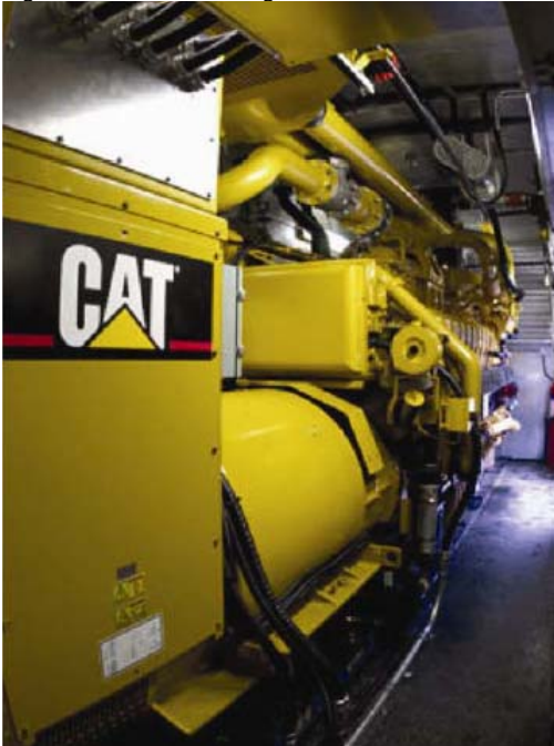
Figure 4: Landfill Gas Engine Generator Set

Landfill gas (LFG) is produced naturally as organic waste decomposes in landfills. LFG is composed of about 50 percent methane, about 50 percent carbon dioxide and small amounts of non-methane organic compounds. At most municipal solid-waste landfills, the methane and carbon dioxide are destroyed in a gas collection and control system or utility flare. However, to use LFG as an alternative fuel, the gas is extracted from landfills using a series of wells and a vacuum system. Pipes are inserted deep into the landfill to provide a point of release for the landfill gases. A slight vacuum is then applied in the pipe to draw the gases into and through it to a central point, where it can be processed and treated for use in generating electricity, replacing the need for conventional fossil fuels. Here are a few examples from around the world of how LFG is used to produce electric power through engine generator sets (see Fig. 4) in landfill configurations.