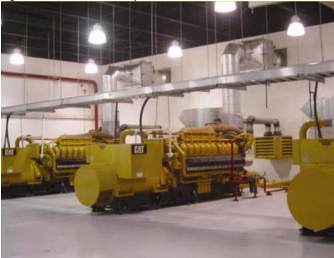
Figure 2: DG in Hurricane City Power Plant

The reliability and cost-effectiveness of this power solution earned Hurricane City Power and Washington City Power a joint award in 2007 for the "Most Improved System of the Year" from the Utah Associated Municipal Power Systems (UAMPS). The city has been able to save as much as $10,000 to $12,000 a day because of their ability to react to market prices quickly, and run their generators instead of buying power on the market when the cost is high. In addition to cost savings for the city, the gensets provide peak power production support and backup power in case of a citywide blackout. Three area blackouts have occurred in the three years since this system has been in place, and the gensets have provided the power needed to get the city up and running with no outside power available.