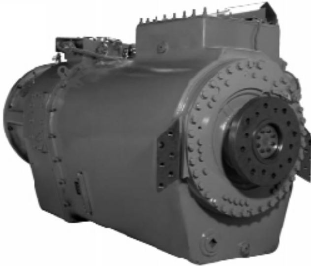
Image shown may not reflect actual transmission