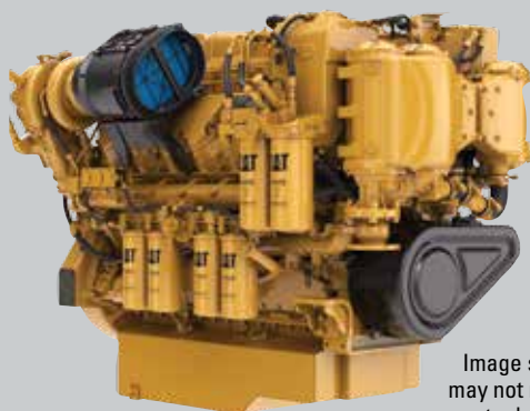
Image shown may not reflect actual engine

1300 bhp 969 bkW WOSR 1800-2100 rpm 1450 bhp 1081 bkW WOSR 2100-2300 rpm