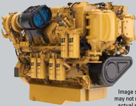
Image shown may not reflect actual engine

850 bhp 634 kW WOSR 1800-2100 rpm 1200 bhp 894 kW WOSR 1800-2100 rpm