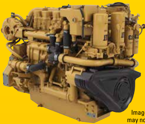
Image shown may not reflect actual engine