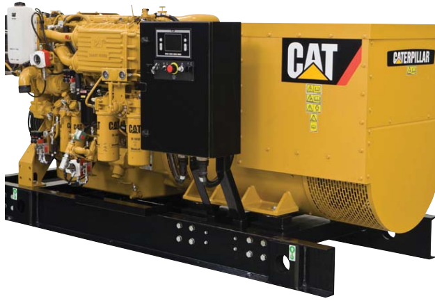
Image may not reflect actual engine