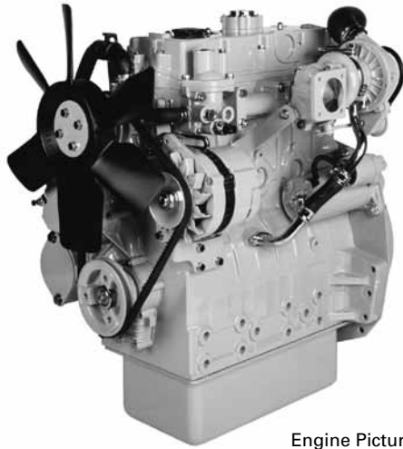
Engine Pictured with Optional Equipment