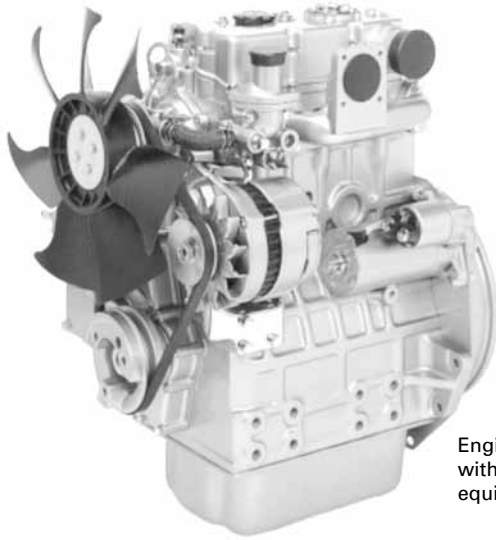
Engine pictured with optional equipment