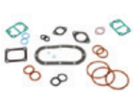
Oil Cooler and Lines Gasket and Seal Kit