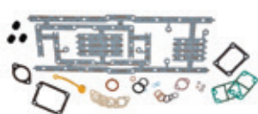
Central and Lower Structure Gasket and Seal Kit