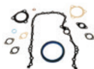
Rear Structure Gasket and Seal Kit