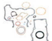
Front Structure Gasket and Seal Kit