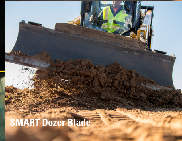
SMART Dozer Blade