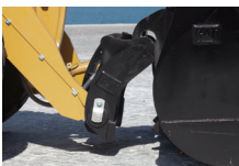
FUSION™ QUICK COUPLER