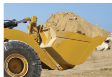
PERFORMANCE SERIES BUCKETS

The Fusion Quick Coupler System allows machines to use a wide range of tools that can each be picked up by machines of varying sizes. Fusion is designed to integrate the work tool and the machine by pulling the coupler and tool closer to the loader, increasing overall lift capability.