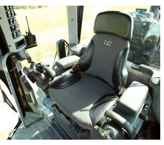
4 - Governmental Solutions