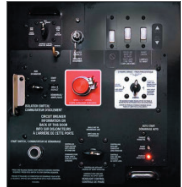
Photo depicts the AESSTM status portion of the engine control panel.