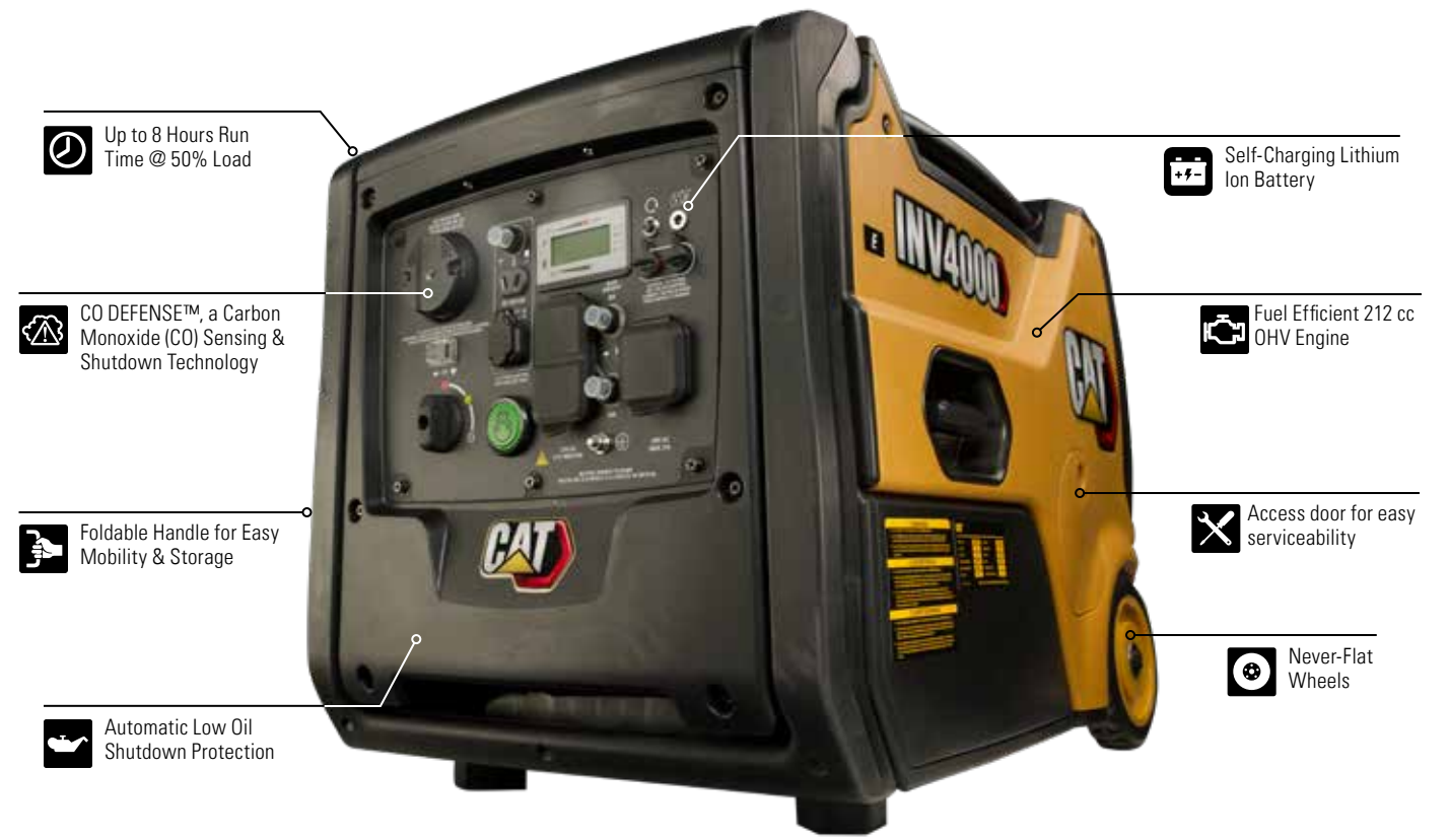
Because of continuing improvements, actual product may differ slightly from this photo.