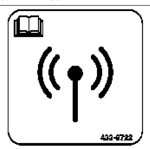
Illustration 2 g03356733

The film in Illustration 2 can be found in a location such as the dash or control panel. The warning film is clearly visible to the operator during the normal operation of the equipment.