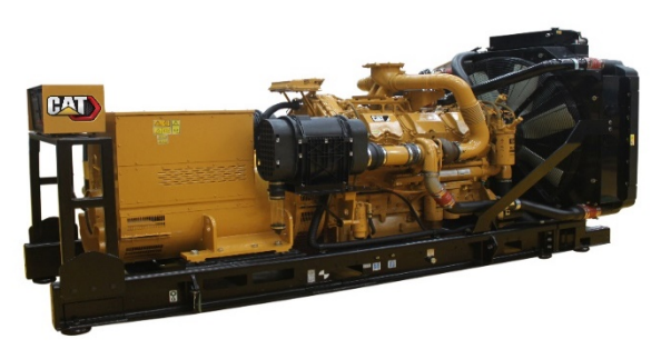
Image shown is for radiator version. Images shown might not reflect actual configuration