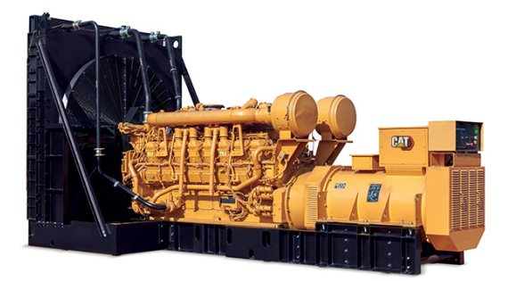
Image shown is for radiator version. Images shown might not reflect actual configuration