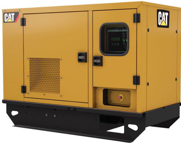
Picture shown may not represent actual configuration