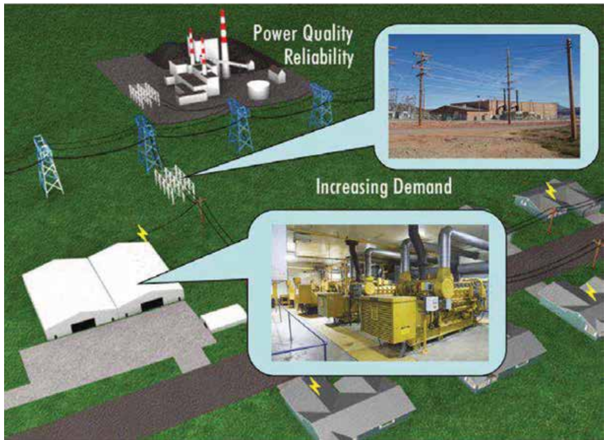
Figure 1: Electric utilities install small-scale distributed generation at the substation level or at the point of end use.

As technology steadily improves engine efficiency and reduces emissions, it is increasingly worthwhile to weigh the advantages of CHP when considering distributed power installations.