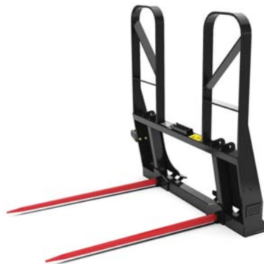
Dual Bale Spear