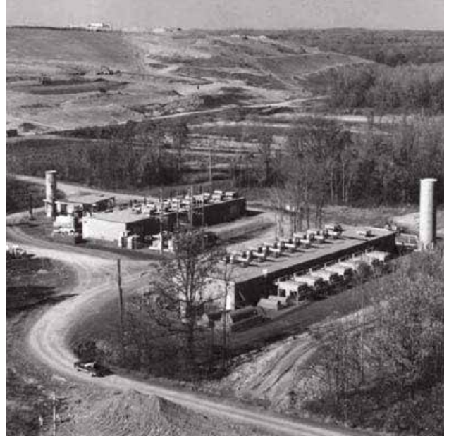
Figure 5: Seneca Meadows Landfill, Seneca Falls, NY

This energy system, owned by Innovative Energy Systems of Oakfield, NY, began operation in 1996 and has been expanded three times to its current 11.2 MW capacity. The system (see Fig. 5) uses fourteen Cat G3516 generator sets that have been modified for landfill use. Overall energy plant NOx emissions are compliant with local air-quality standards.