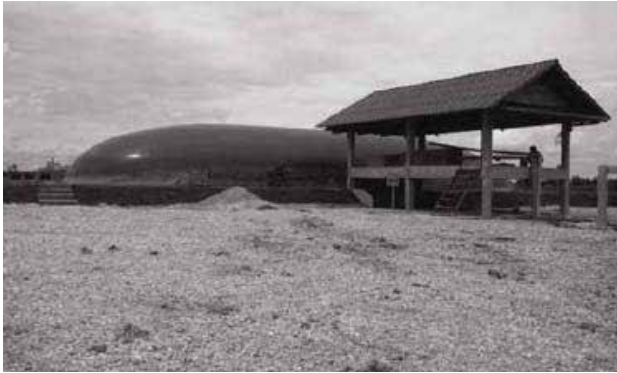
Figure 8: Buffer Tank and Digestion Process in Thailand