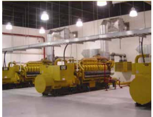
Figure 2: DG in Hurricane City Power Plant

The reliability and cost-effectiveness of this power solution earned Hurricane City Power and Washington City Power a joint award in 2007 for the "Most Improved System of the Year" from the Utah Associated Municipal Power Systems (UAMPS). The city has been able to save as much as $10,000 to $12,000 a day because of their ability to react to market prices quickly, and run their generators instead of buying power on the market when the cost is high. In addition to cost savings for the city, the gensets provide peak power production support and backup power in case of a citywide blackout. Three area blackouts have occurred in the three years since this system has been in place, and the gensets have provided the power needed to get the city up and running with no outside power available.