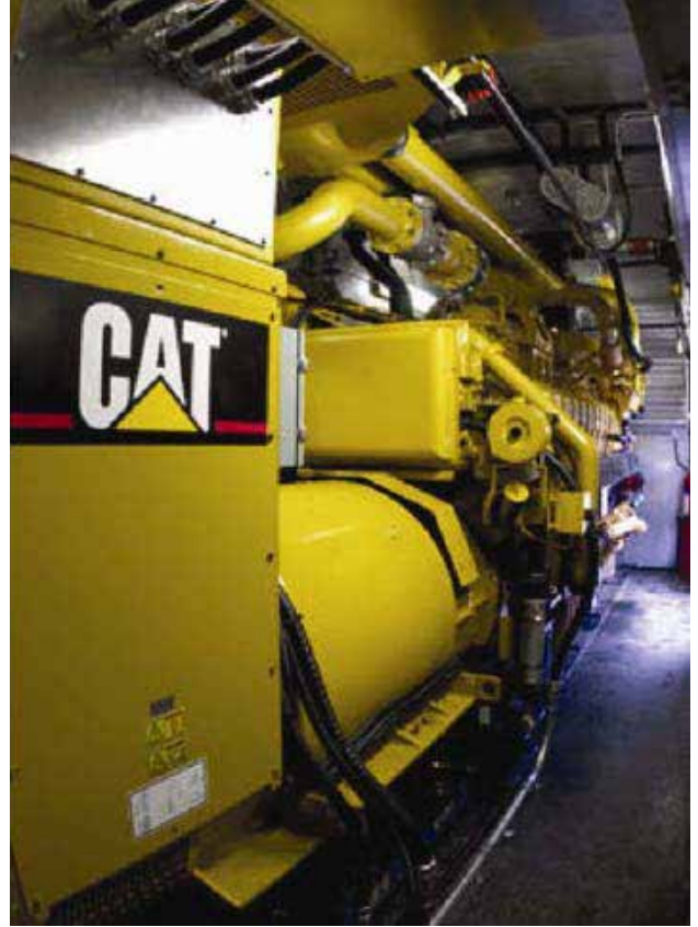
Figure 4: Landfill Gas Engine Generator Set

Landfill gas (LFG) is produced naturally as organic waste decomposes in landfills. LFG is composed of about 50 percent methane, about 50 percent carbon dioxide and small amounts of non-methane organic compounds. At most municipal solid-waste landfills, the methane and carbon dioxide are destroyed in a gas collection and control system or utility flare. However, to use LFG as an alternative fuel, the gas is extracted from landfills using a series of wells and a vacuum system. Pipes are inserted deep into the landfill to provide a point of release for the landfill gases. A slight vacuum is then applied in the pipe to draw the gases into and through it to a central point, where it can be processed and treated for use in generating electricity, replacing the need for conventional fossil fuels. Here are a few examples from around the world of how LFG is used to produce electric power through engine generator sets (see Fig. 4) in landfill configurations.