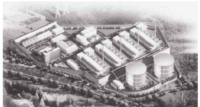
Figure 10: Jingcheng CMM 120 MW Power Project

Sixty Cat G3520C generator sets with low energy fuel packages run on CMM at the Sihe mine in Jingcheng, Shanxi province of China (see Fig. 10). The Cat G3520C operates at 1500 rpm with a continuous rating of 1,966 kW under standard operating conditions. An open combustion chamber design allows it to operate using low-pressure gas supplies of just 5 to 35 kPa (0.7 psi to 5 psi). The low boost pressure requirement reduces the installation cost of the fuel treatment systems often found in low-energy fuel environments.