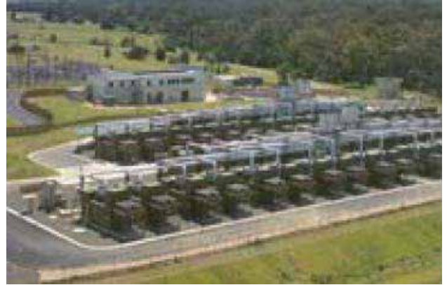
Figure 9: Appin and Tower Coal Seam Energy Project

The Appin and Tower project (see Fig. 9) is one of the largest coal seam gas energy systems in the world and one of the world's largest engine-generator installations of any kind. The Appin and Tower projects consume 600,000 m 3 of coal seam gas per day from two separate mines in New South Wales, Australia. Supplementing with natural gas when necessary, the Appin and Tower project uses more than 90 Cat G3516 lean burn generator sets, each of which produces 1,030 kW of continuous power. As of the summer of 2008, most units had completed over 80,000 hours of operation.