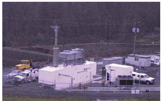
Figure 6: Harland Landfill, Victoria, BC, Canada

The landfill receives municipal solid waste from a population of roughly 400,000. Until the power generating system went online, the landfill gas had been flared. Independent power producer Maxim Power Corporation of Calgary, Alberta, installed the landfill-gas-to-energy system (see Fig. 6). The electric energy output (continuous duty at 1.6 MW) is being sold to BC Hydro for that company's Green Power program.