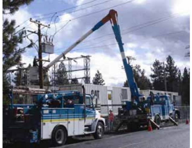
Figure 1: Cat XQ2000 Power Modules in Chester

Chester's lights remained on and the aging poles were replaced. PG&E avoided the combination of lost power sales during any outage, and the added expense and safety concerns of having to work crews around the clock for 72 hours to replace all the poles.