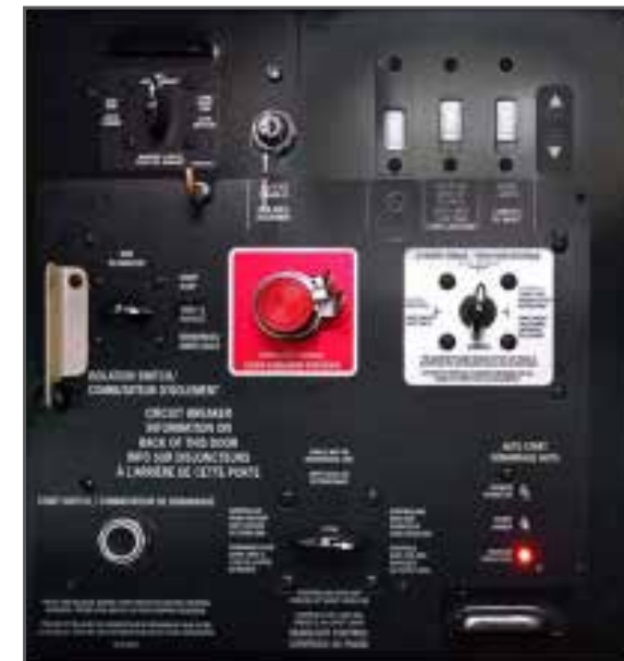
Photo depicts the AESS status portion of the engine control panel.