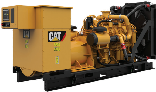
Image shown may not reflect actual configuration