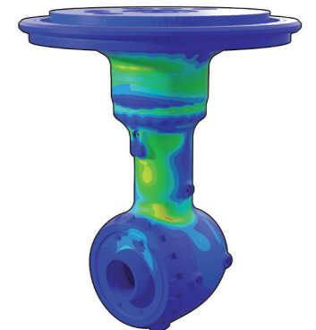
Structural optimization and verification by advanced simulations