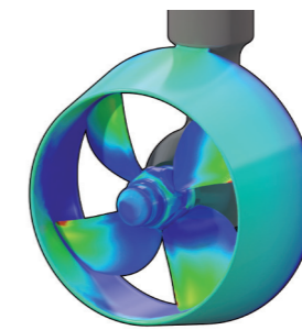
Hydrodynamic optimization by CFD simulations