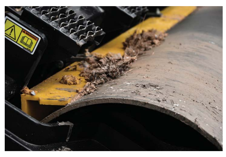
Material Scraper Bar Spring-loaded dual direction scraper bar prevents material build up.