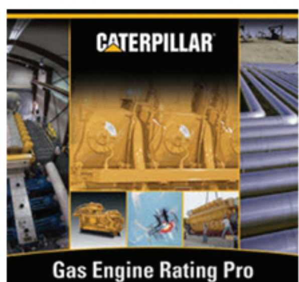
Gas Engine Rating Pro

The Cat Gas Engine Rating Pro (GERP) software has long been an industry mainstay, but as engine technology advances, so does GERP. The latest iteration offers advanced data collection and analysis, helping you make informed decisions to get the most out of your power production.