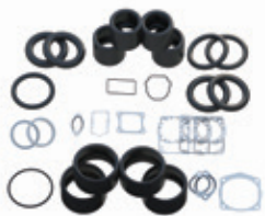
Single Cylinder Head Kit