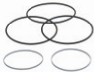
Single Cylinder Liner Gasket Kit