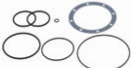
Water Pump Installation Kit