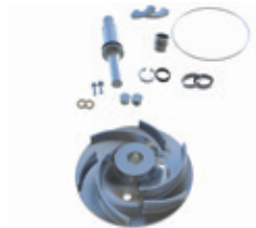
Water Pump Rebuild Kit