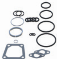
Front Structure Kit