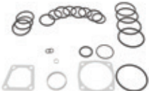
Oil Cooler and Lines Kit