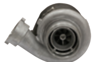
Turbo / Turbo Cartridge

For your most effective overhaul, we recommend inspecting, reconditioning or replacing additional components, including: