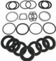
Rear Structure Kit

Select as many gasket and seal kits as you need — also consider adding key components necessary to improve overhaul effectiveness, including: