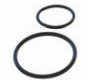
Single Fuel Injector Kit