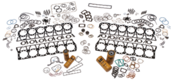
TOP END Foundational Level Kit

Select as many gasket and seal kits as you need – also consider adding key components necessary to improve overhaul effectiveness, including: