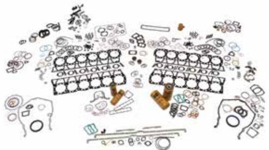
MAJOR OVERHAUL Foundational Level Kit