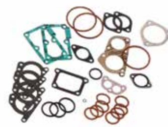
Oil Cooler and Lines Gasket and Seal Kit