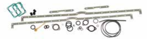
Central and Lower Structure Gasket and Seal Kit