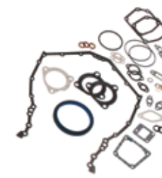
Rear Structure Gasket and Seal Kit