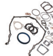
Rear Structure Gasket and Seal Kit