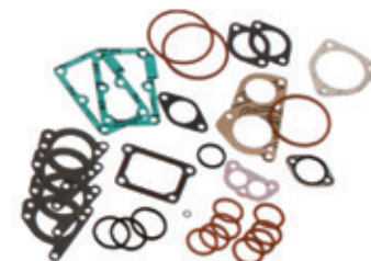
Oil Cooler and Lines Gasket and Seal Kit