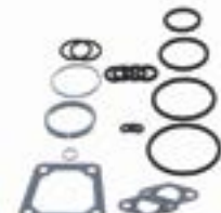
Front Structure Kit