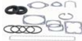
Aftercooler and Lines Kit