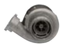
Turbo / Turbo Cartridge

For your most effective overhaul, we recommend inspecting, reconditioning or replacing additional components, including: