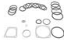
Oil Cooler and Lines Kit