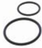
Single Fuel Injector Kit