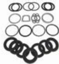
Rear Structure Kit

Select as many gasket and seal kits as you need — also consider adding key components necessary to improve overhaul effectiveness, including: