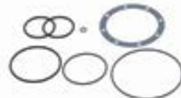
Water Pump Installation Kit