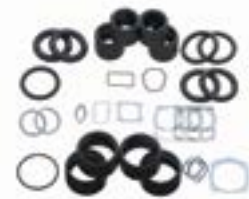
Single Cylinder Head Kit