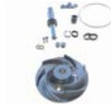
Water Pump Rebuild Kit