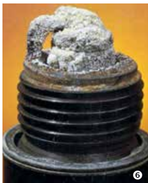
Spark plug contaminated with Siloxanes

In some cases, it may be more attractive to owners to defer on the installation costs associated with advanced fuel treatment systems, and accept the operating costs associated with shorter maintenance and overhaul intervals. This 'pay me now or pay me later' dilemma is often decided based on a developer's assessment of risk and reward.