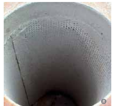
Inside of a muffler with Siloxane residue