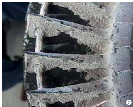
Siloxane build up on Turbocharger turbine wheel