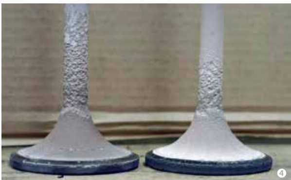
Exhaust valve with Siloxane buildup

While effective at reducing contaminants in the fuel, fuel treatments do add to biogas-to-energy system capital costs, add parasitic loads to the system, and require additional maintenance materials and labor.