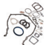
Rear Structure Gasket and Seal Kit

Select as many gasket and seal kits as you need – also consider adding key components necessary to improve overhaul effectiveness, including: