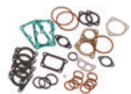
Oil Cooler and Lines Gasket and Seal Kit

*Includes all gaskets and seals required for a complete overhaul, and many 100% replacement items – ranging from thermostats to gear bushings.