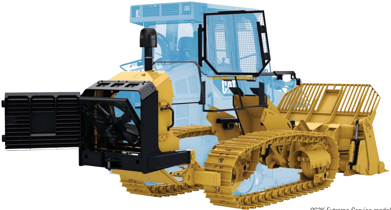
963K Extreme Service model shown.