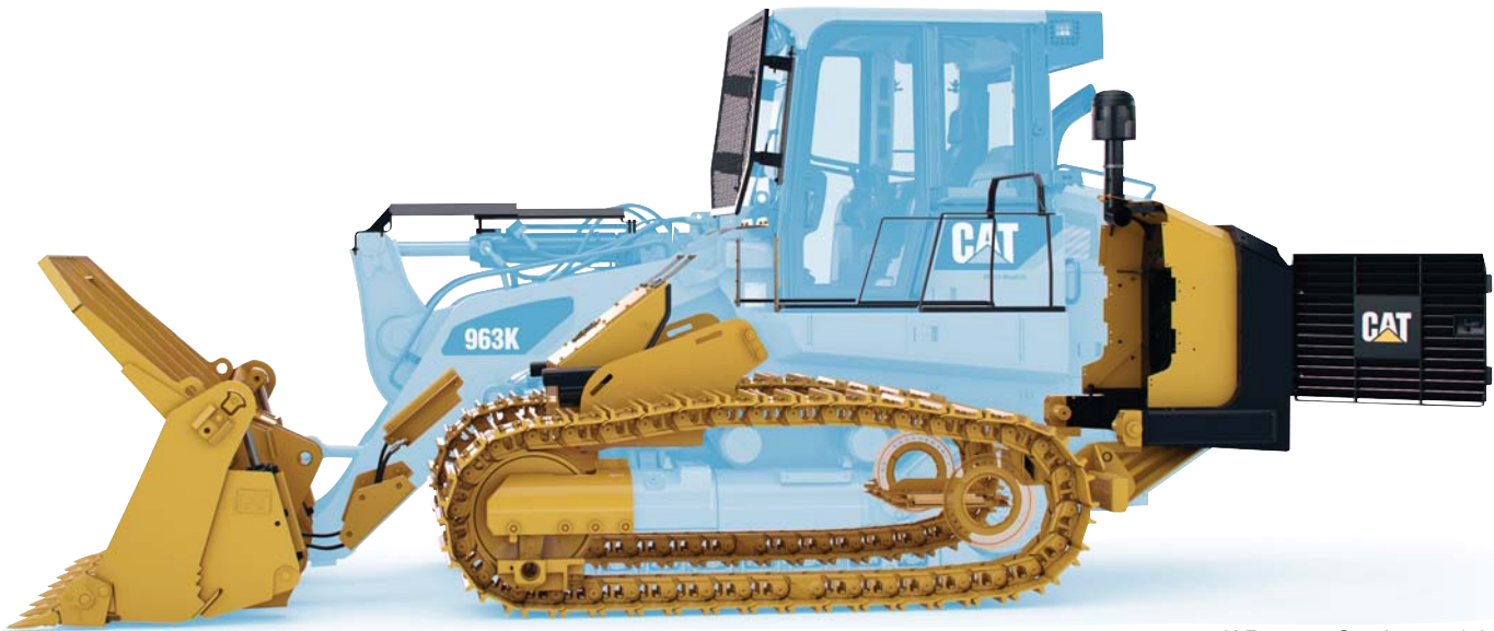
963K Extreme Service model shown.