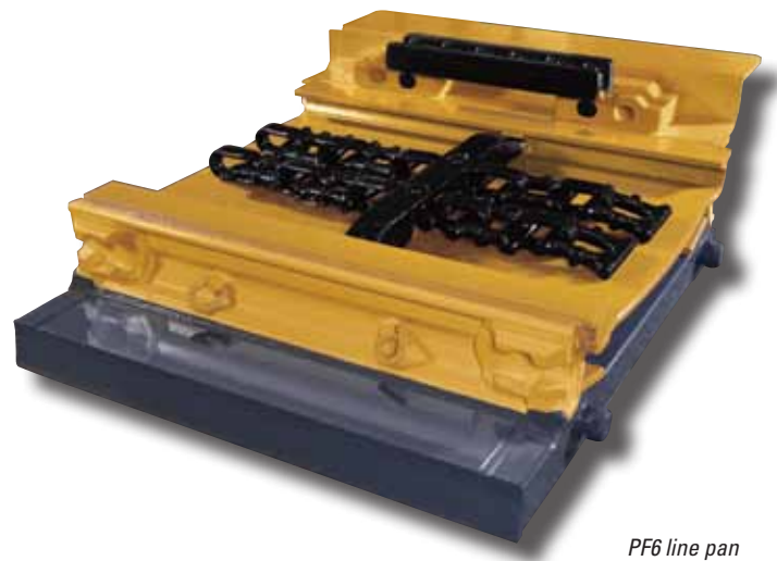
PF6 line pan

Caterpillar offers a range of line pans to suit different needs. These range from the PF3 for capacities of up to 1 300 tonnes (1,433 tons) per hour to the state-of-the-art PF6 with a capacity of 5 000 tonnes (5,512 tons) per hour.