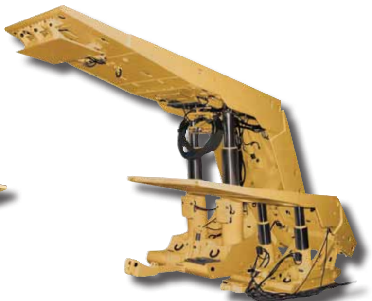
Two-meter-wide roof supports