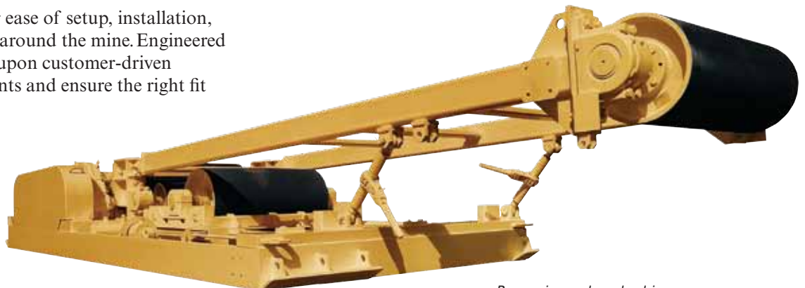
Pre-engineered combo drive

Cat tail sections are designed to accept loading from a variety of haulage equipment and other belt conveyors.