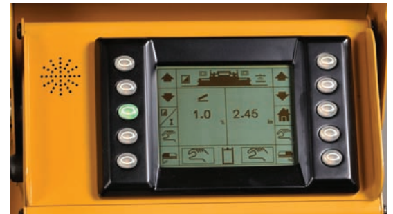
Cat Grade and Slope Control