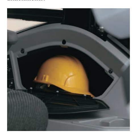
Storage Compartment. New lockable, left side storage is standard.

The sloping front hood and divergent lift arms allow the operator to see more of the forward work area and loader attachments.