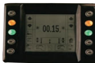
AccuGrade Laser Display