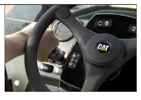
Optional Auto-Shift Transmission Work faster with the optional Auto-Shift transmission. The Auto-Shift transmission provides automatic shifting between five forward and three reverse gears. There is no floor mounted shift lever, so the operator has more floor space and better access through the right hand door.