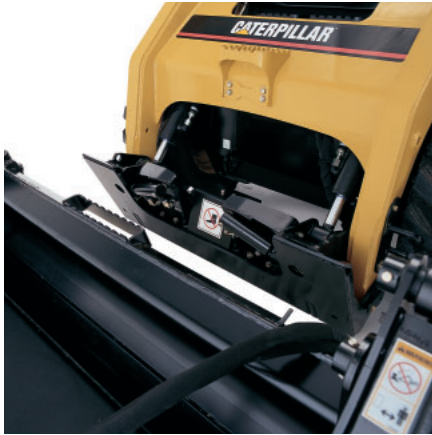
Optional Hydraulic Quick Coupler

Choose from a wide variety of work tools that are performance-matched to the Cat Skid Steer Loader.