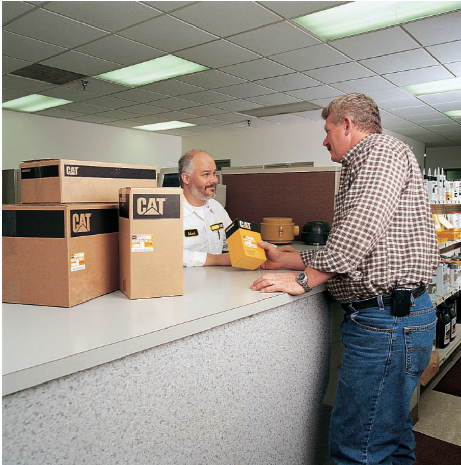
Worldwide Parts Availability

Cat dealer services help you operate longer with lower costs.