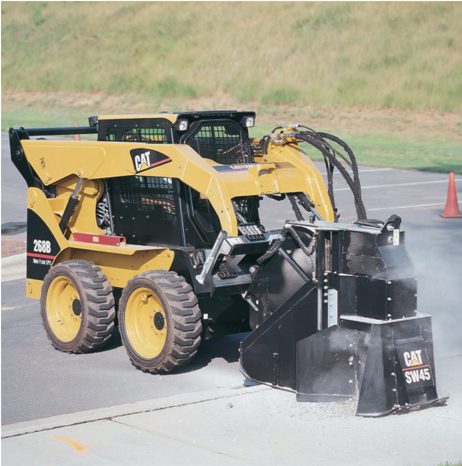
Cat SW45 Wheel Saw

The hydraulic system has built-in reliability and provides exceptional lift, breakout and auxiliary power to work tools.