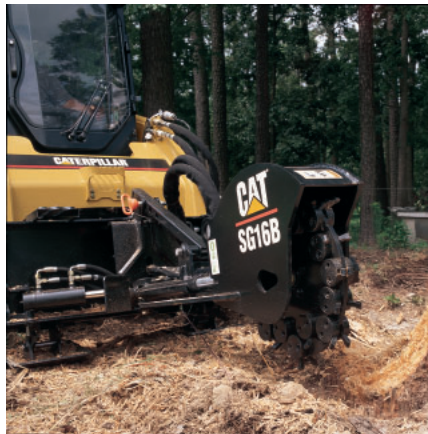
Cat SG16B Stump Grinder

An optional hydraulic quick coupler is also available and allows engagement and disengagement of work tools without the operator needing to exit the machine. Control of the coupler by use of a rocker switch inside the cab makes work tool changes quicker and easier.