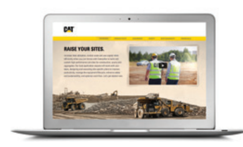
Put our capabilities to work in your business.

Managing the load-out of your product into trucks, bins, barges or railcars is essential to an efficient operation. We analyze data from your fleet and other sources to determine load consistency, frequency, scheduling efficiency and stockpile location. Based on this analysis, we recommend strategies for streamlining the loading cycle and reducing operator waiting time.