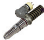
Injectors / Nozzles