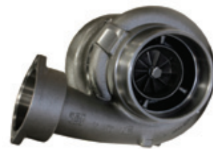
Turbo / Turbo Cartridge