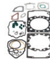
Single Cylinder Head Gasket and Seal Kit