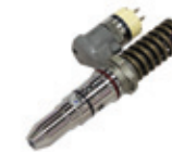
Injectors / Nozzles