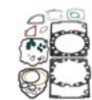
Single Cylinder Head Gasket and Seal Kit