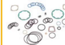
Oil Cooler and Lines Gasket and Seal Kit