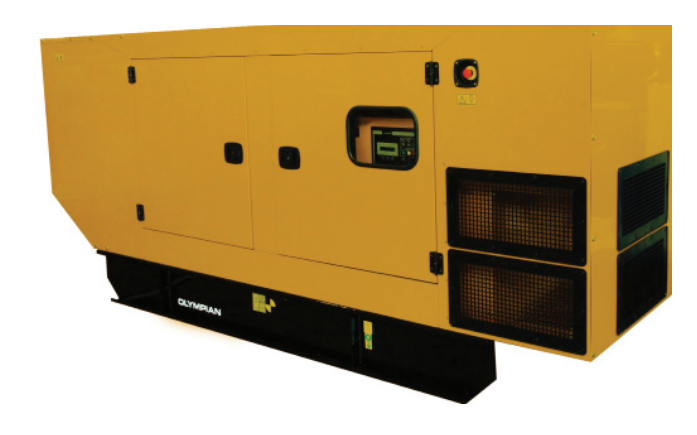
Enclosure pictured may include optional accessories