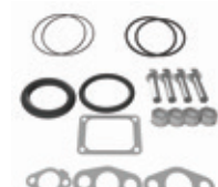
Turbocharger Installation Gasket Kit