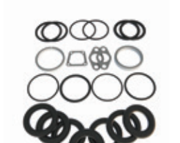
Rear Structure Kit

Select as many gasket and seal kits as you need — also consider adding key components necessary to improve overhaul effectiveness, including: