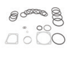
Oil Cooler and Lines Kit