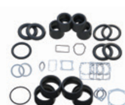
Single Cylinder Head Kit