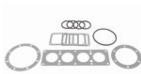
Expansion Tank Gasket Kit