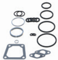
Front Structure Kit