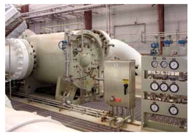
C65 Gas Compressor

The C65 gas compressors have the latest state-of-the-art technology combined with the experience and reliability that comes with building and installing over 5000 compressors. These compressors are designed in compliance with API 617, a requirement for the severe environments and operating conditions this equipment may encounter.