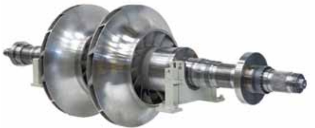
Typical C65 Rotor