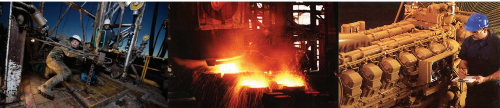
Planning for temporary power may require the need to prioritize critical electrical loads.

An additional note: Rental power is often used to back up standby generator sets during scheduled and emergency outages. To find out how much temporary power you need for standby service, contact the company that supplied the standby generator, or a qualified rental generator set dealership.