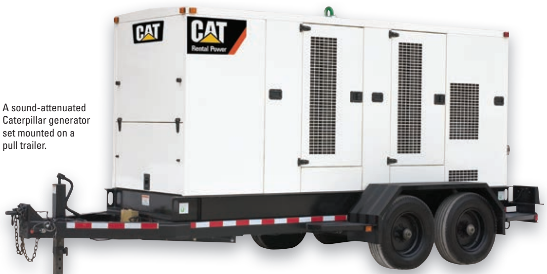
A sound-attenuated Caterpillar generator set mounted on a pull trailer.